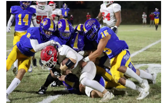
The Wolverines taking down the runner.