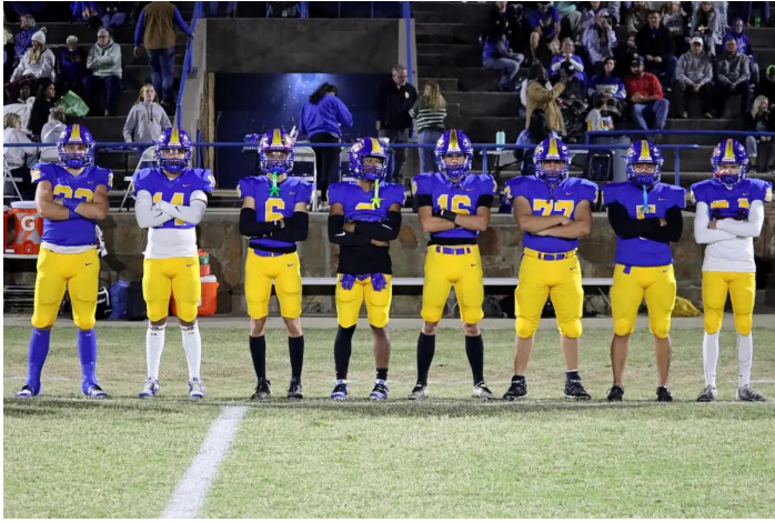
The Seniors taking the field on Senior Night.